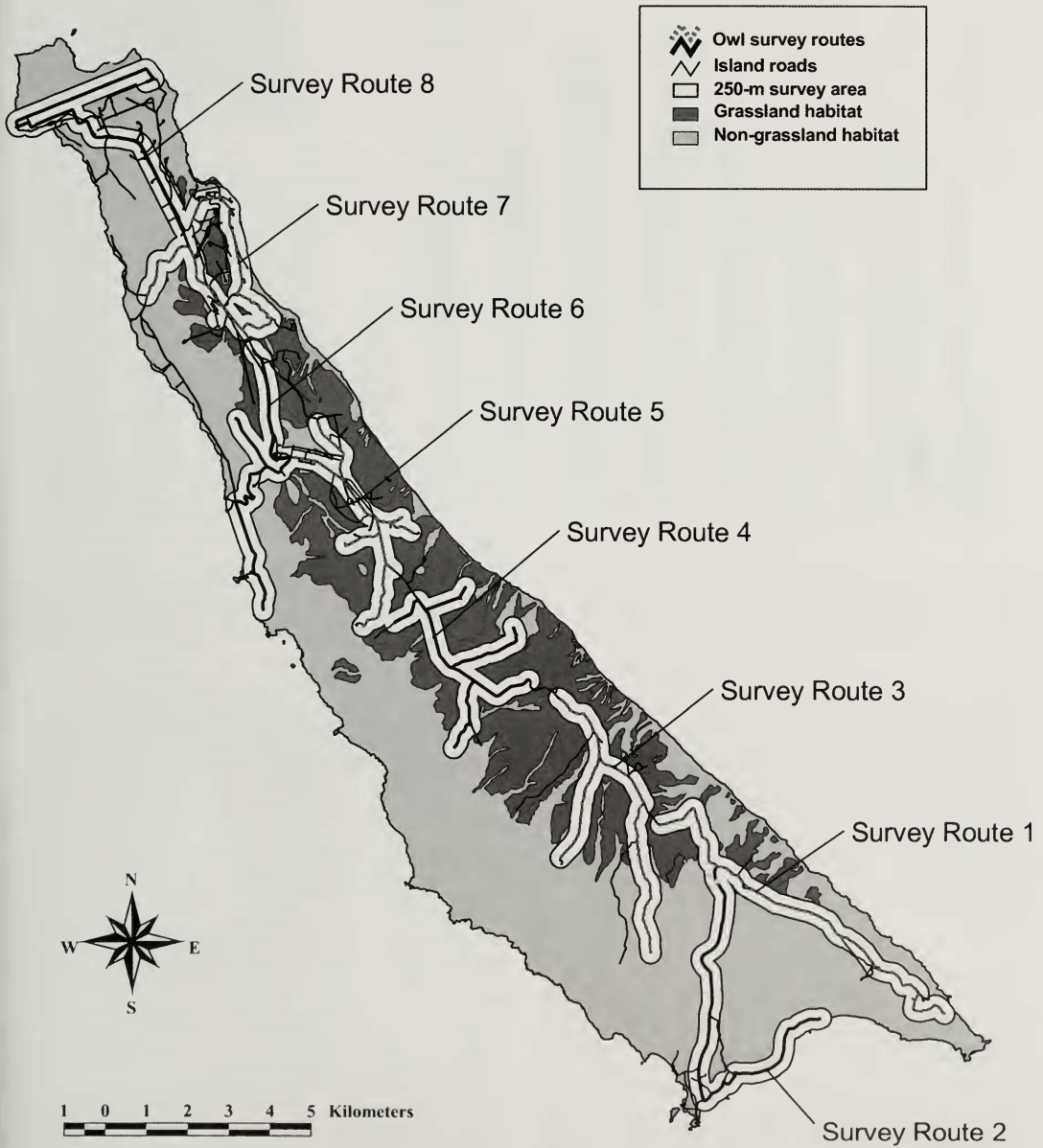
FIG. 1. Map of eight roadside transects used to survey grassland owls on San Clemente Island, California, 2001 and 2002.

uneven survey coverage; no surveys were conducted during some time-blocks (i.e., 10, 11, and 12 hr past sunset) and, during others, we were given regular access. These access constraints prevented us from standardizing how transects were surveyed over various time-blocks, which could influence survey results if there are time-dependent associations in owl activity. However, because we had little